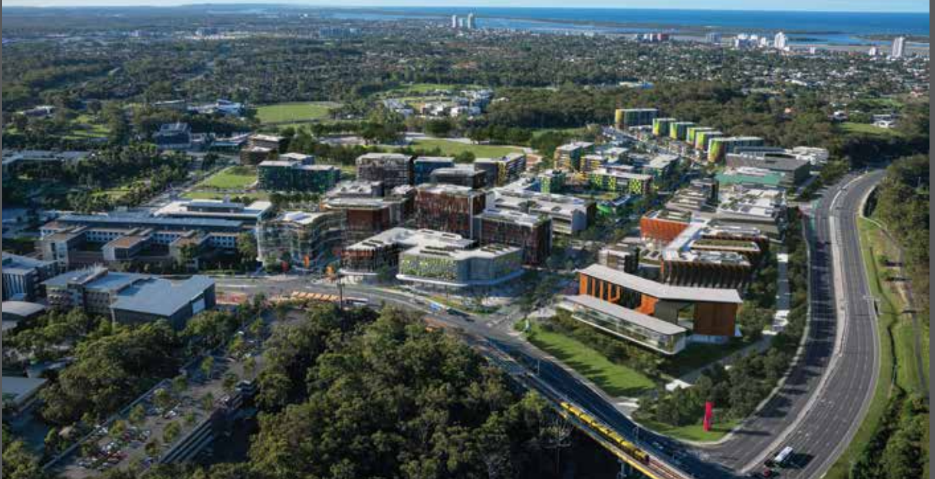
artist's impression: the Gold Coast Health and Knowledge Precinct of the future