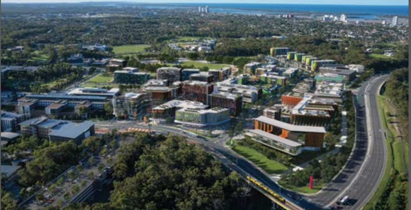
artist's impression: the Gold Coast Health and Knowledge Precinct of the future

The logo consists of the letters 'H' and 'K' in a bold, white, sans-serif font, separated by a plus sign '+'. The logo is set against a solid red square background.